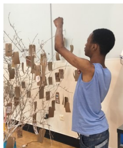
Decorating the 'Thankyou Tree.'

Well done to all the hardworking students in Magnolia Class. Amazing work!