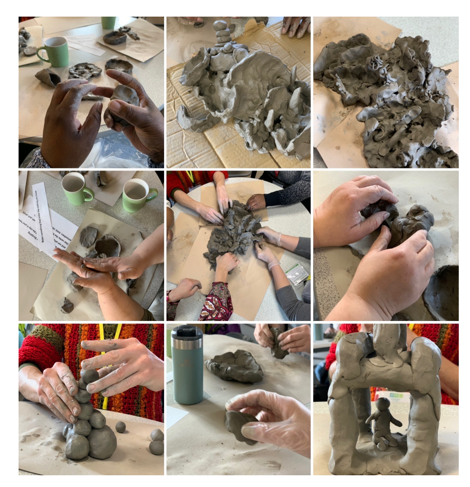
This term, there has been a variety of parent coffee mornings, including an 'art workshop' (as shown in photo) There are plenty more coming up, hopefully see you then.

On the 3rd of April, parents and carers attended the Trauma Informed Workshop with Caoimhe, our Educational Psychologist. We explored Trauma and its impact, trauma informed strategies to support emotional wellbeing and we also discussed how to build resilience and self-care practices.